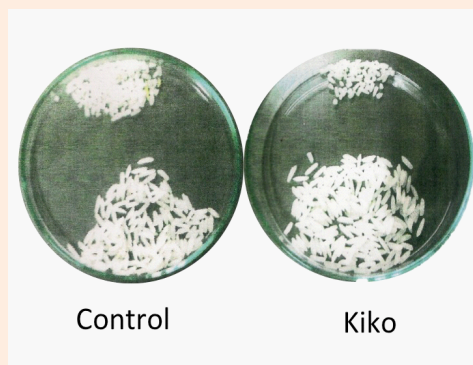
Figure 3: Sorting of intact grains from 6 ml volume of rice grains from Control versus Kiko-treated plots in one of the Thai studies. Of the 246 rice grains from the Control plot, 156 were intact (lower) and 93 (38%) were broken (cracked plus immature). The corresponding numbers of intact versus broken grains numbers from the Kiko-treated plot were 146 and 56 (25%), respectively. The percentages of "head rice grains" in a Philippine study increased to 64.3% versus the matching control value of 54.6%. Improved millable rice was also shown in the Australian study and generally noted by the other participating farmers.

Ongoing additional applications of Kiko-treated water in rice farming now include soaking of the rice seeds for 24-48 hours in 100 liters of water containing a Kiko cartridge, prior to transfer to the nursery growing of the seedlings. This practice is supported by earlier studies showing rice seeds placed in Kiko-water germinated faster and at a higher percentage (e.g. 96% vs. 85% in one study) than seeds placed into regular water. The Vietnamese farmer now uses one-third less fertilizer, while another farmer no longer uses lime since in the initial study the soil pH in the Kiko-treated field naturally raised from 5.5 at the time of seeding to 7.0 at the time of harvest. Other farmers have also reported stabilization of pH value of the soil in Kiko-treated fields with rather constant values of 6.8 to 7.8 in the different test sites over extended periods of time.