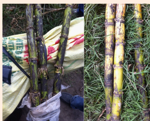
Figure 4: Comparison of sugarcane harvested from the Kiko-treated field (left) with the sugarcane harvested from the Control field. The sugarcane was harvested 1 year after planting. The green versus yellow color and longer intermodal length of the sugarcane from the Kiko-treated field are clearly apparent. On average at the time of harvest, the diameter of the sugarcane stalks from the Kiko-treated plots was 11.3% greater than that of the control stalks.