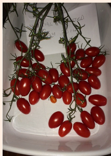
Figure 6: Tomatoes harvested 40 days earlier by an Australian farmer from Kiko-treated soil. The standard post-picking unrefrigerated time before tomatoes harvested from untreated areas show clearly noticeable spoilage is 20 days. This photograph is an illustrative example of the consistent observation that many vegetables harvested from Kiko-treated soil have an extended shelf life. They are also commonly reported as tasting better.