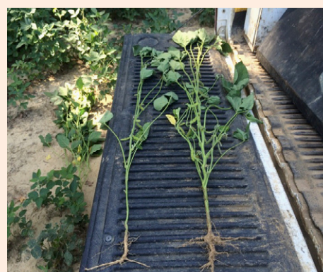
Figure 7: Representative comparison between a soybean plant grown in the Control plot (left) with a similarly aged plant grown in a Kiko-treated plot (right). The plants were harvested 49 days after planting. The larger size, more branching, and increased number of soybean pods (39 versus 9), along with a far better developed root structure is apparent in the plant from the Kiko-treated plot.

(as in the Kiko technology), magnesium oxide and mica. While commonly regarded as only providing useful minerals and/or removing heavy toxic minerals, laboratory studies conducted by the author show that they all have considerable intrinsic water activating activity [1]. This activity can be greatly enhanced by heating the materials to between 1,000 °C to 1,500 °C during or after the extraction process. The author has shown [1] that once water is sufficiently activated, the activating compound can be removed either by progressive dilution as in homeopathy [6,12] or by passage through zero-residue filters, eliminating any